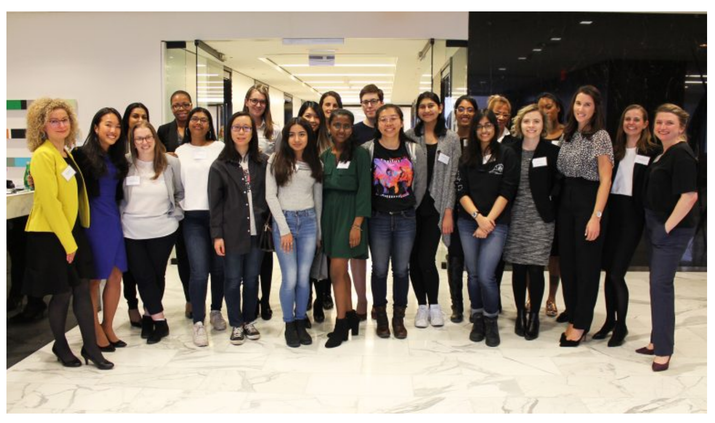
WeirFoulds mentors and GEM participants gather in the WeirFoulds office lobby following the speed mentoring event.